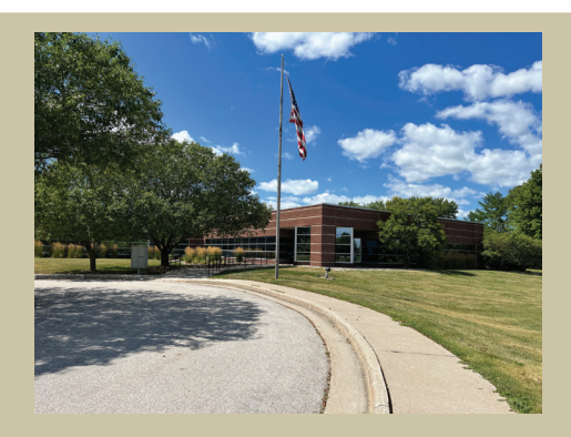
*Some staff are primarily located at other locations.

2325 N. Loop Drive Building 6, Suite 6215 Ames, Iowa 50010 515-294-8224